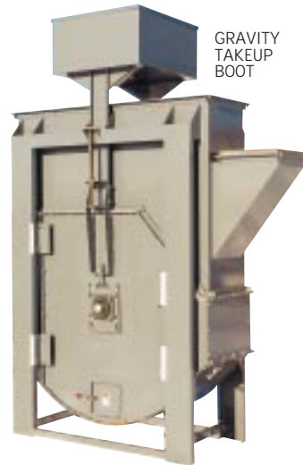
GRAVITY TAKEUP BOOT

Self cleaning, self adjusting takeup design features a full-floating boot section. (See photo at right).